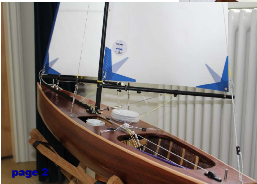
Photo left: a fine One Metre class yacht built in timber by the owner Colin Cooper. Nylet sails in white Dacron with blue standard corner patches.